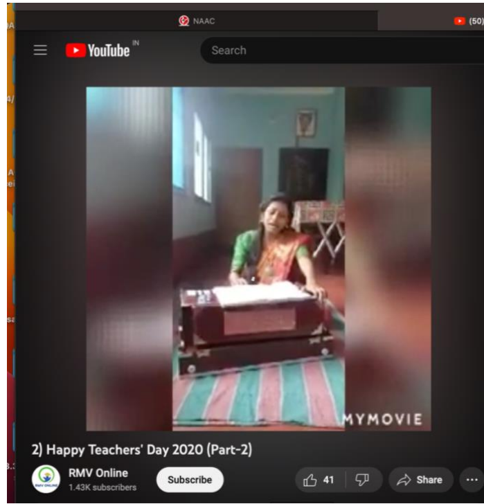
Teachers' Day Celebration via online mode